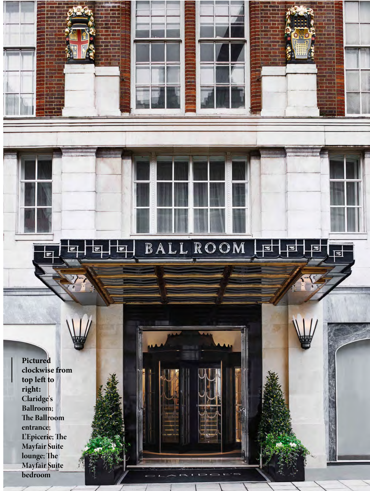
Pictured clockwise from top left to right: Claridge's Ballroom; The Ballroom entrance; L'Epicerie; The Mayfair Suite lounge; The Mayfair Suite bedroom