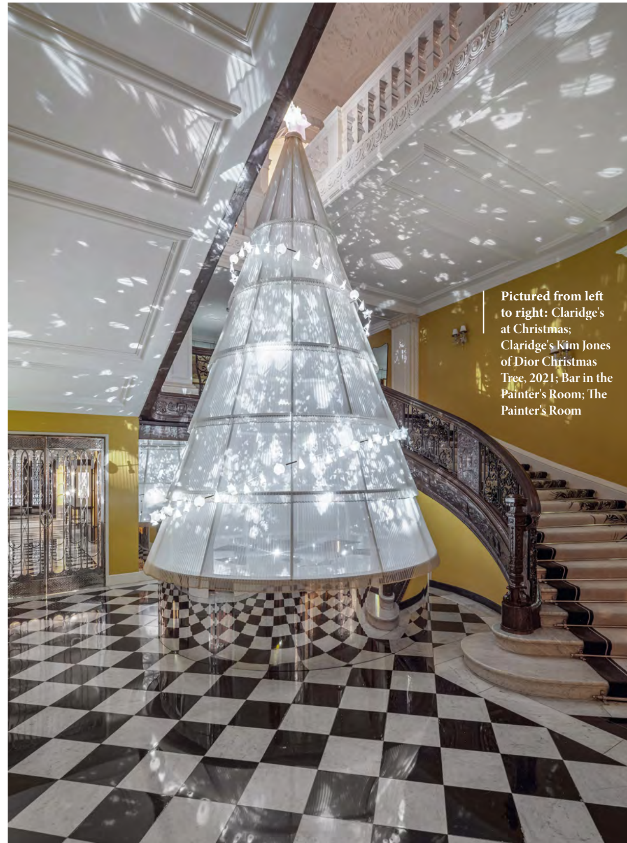
Pictured from left to right: Claridge’s at Christmas; Claridge’s Kim Jones of Dior Christmas Tree, 2021; Bar in the Painter’s Room; The Painter’s Room

Despite its enduring popularity, Claridge’s never rests on its laurels. Earlier this year, the