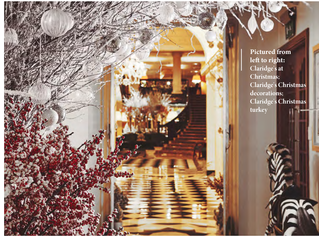
Pictured from left to right: Claridge's at Christmas; Claridge's Christmas decorations; Claridge's Christmas turkey